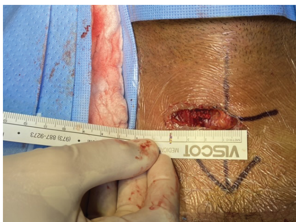
Figure 2: 4 cm minimal invasive parathyroidectomy incision.