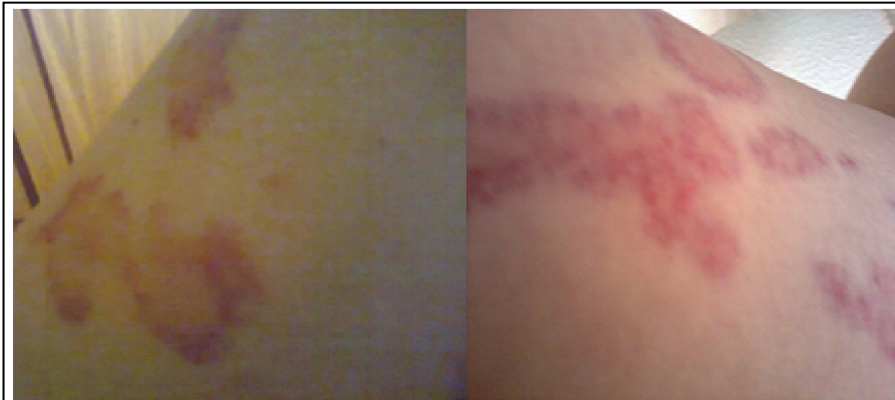
Figure 1: Small vessels neutrophilic vasculitis on right leg, confirmed by biopsy.

One month after the administration of the rituximab, she could breathe without mechanical ventilation and there were no episodes of dyspnea. During the following five months there were no signs of any urticaria or cutaneous vasculitis, and she started regaining her quality of life. The last CT Scan