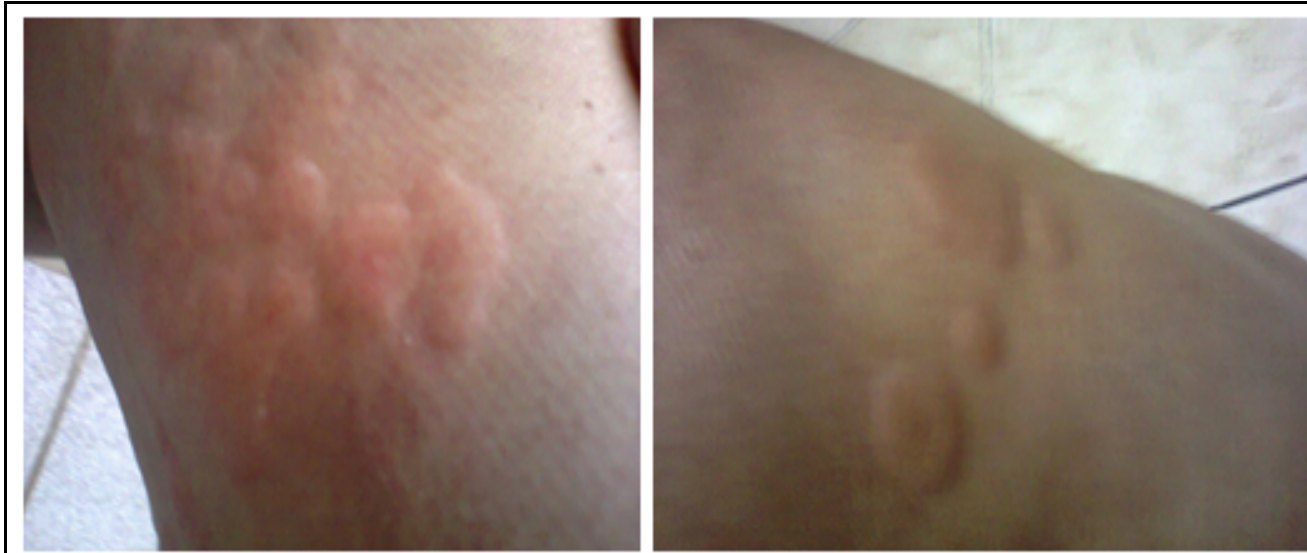
Figure 2: Autoimmune urticaria on right and left leg, respectively.