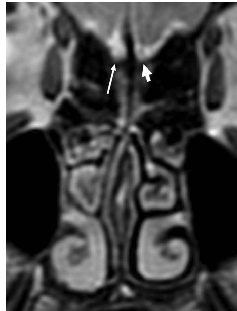
Figure 1b: Magnified section more clearly reveals right olfactory nerve aplasia (thin arrow) and left olfactory nerve hypoplasia (thick arrow).

nia should be suspected. Patients with congenital anosmia often have no other complaints or abnormalities, but nearly all will have absent or hypoplastic OBTs, the latter defined as an OBT that is less than half the volume of the average OBT for that age [5]. In one study of 16 patients with isolated congenital anosmia, 5 (31%) had bilateral OBT hypoplasia, 3 (19%) had unilateral aplasia and unilateral hypoplasia, and 8 (50%) had bilateral aplasia [6].