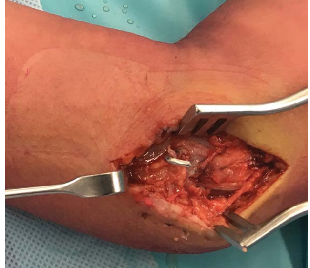
Figure 2: K-wire with a fibril of the ulnar nerve wrapped around it.

Supracondylar fractures of the humerus are a common injury among paediatric patients. Treatment ranges from