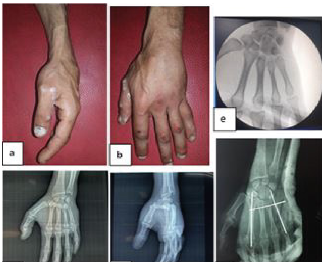
Figure 5: (a) Oedema of the dorsal aspect of the right wrist; (b,c) CMC dislocation of the last 4 fingers with fractures of the metacarpal bases; (d) Ipsilateral Terrible triad dislocation of the elbow associated with CMC dislocation; (e,f) Reduction and fixation by intramedullary pinning.

case of patients for who the cross-wire splinting had been carried out. The average follow-up time was 6.64 months, with extremes of months 6 and 16 months.