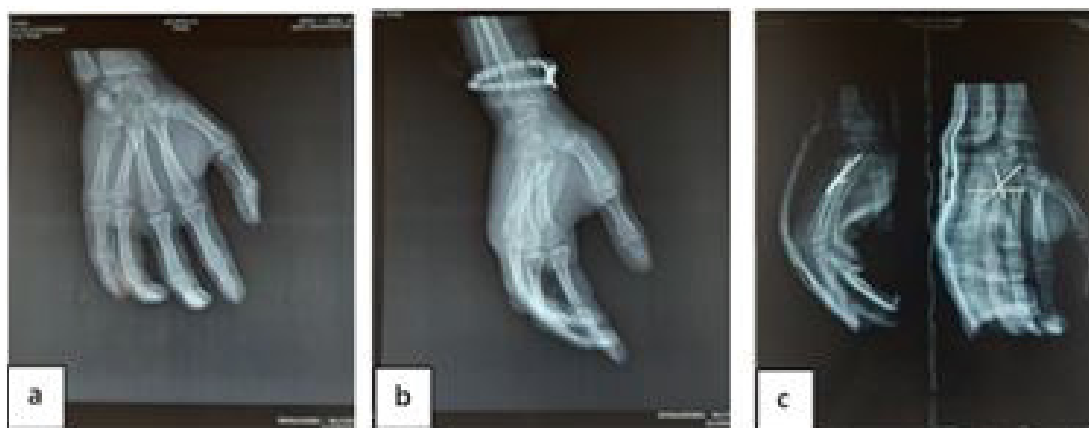
Figure 4: (a-c) Isolated palmar spatular dislocation of the fourth finger of the right hand, treated openly after reduction and fixation by cross pinning.