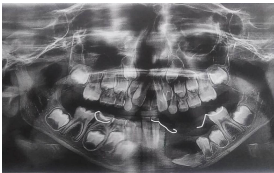
Figure 3: 8 months post-operative radiograph.