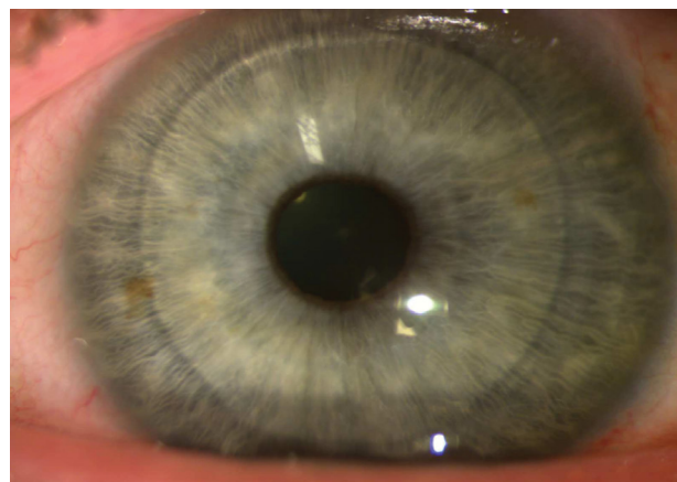
Figure 3: Slit lamp view of the cornea 1-year post-op. The graft is clear and centrally positioned.