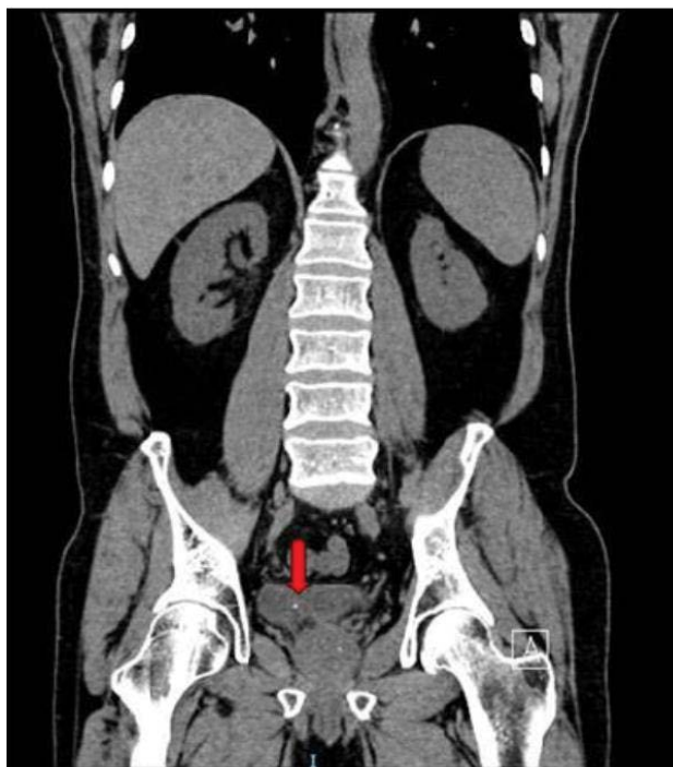
Figure 1: Helical CT of the abdomen and pelvis without intravenous or oral contrast administration, showing a 1.8 mm right ureterovesical junction calculus (arrow).

However, neurological symptoms can occur because of occlusion of carotid, vertebral, spinal arteries, vasa nervorum of peripheral nerves, or because of hypotension and related cerebral perfusion deficit [3]. They may be dramatic, and are sometimes the only symptoms, masking the underlying dis-