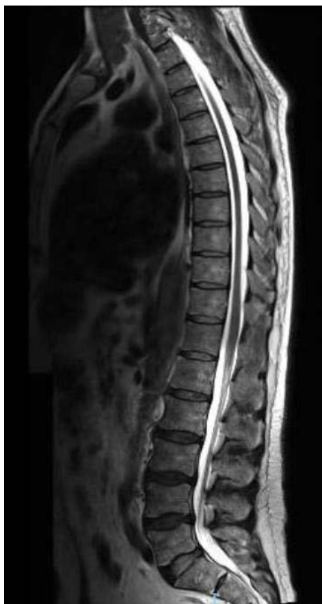
Figure 2: Total spine 3 Tesla MRI, with a T2-weighted sagittal plane shown here, with normal thickness and signal intensity of the spinal cord and conus medullaris.

ease [4]. It is especially in these pain-free dissections (which occurs in 5-15%) [5] with predominant neurological symptoms that the diagnosis of AD is difficult and delayed, and therefore increasing the mortality rate. Neurological presentation in painless type A AD include ischemic stroke (15.7%), ischemic neuropathy (10.8%), syncope (5.9%), hypoxic encephalopathy (2%) and spinal cord ischemia (1%) [3]. The latter has been reported in few cases as the presentation of mostly type B AD. It can manifest as a complete transverse spinal cord infarction as well as anterior spinal cord syndrome, Brown-Sequard syndrome, progressive myelopathy or more rarely transient spinal cord ischemia [6-8].