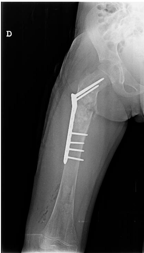
Figure 3A: Anteroposterior and lateral x-rays of femur, showing the surgery result of curettage, bone grafting and plating on the fracture.

bone graft and internal fixation with good functional and radiographic result.