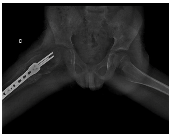
Figure 4B: Anteroposterior and lateral xrays of femur, showing good bone graft osteointegration and fracture consolidation.

The lateral approach allowed us to work directly on the lesion, with a window for curettage and grafting. The internal fixation with a low contact dynamic plate gave us the advantage of strong fixation on the femoral neck without lesion of the physis and bypass the lesion giving compression on the grafted zone. Similar technique was described with success by Nakamura on 13 patients with one superficial infection and one chronic muscular pain with implant removal after 7 years from index surgery [9].