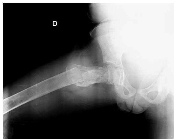
Figure 2B: Anteroposterior and lateral xrays of femur, showing the fibrous dysplasia and an undisplaced fracture through the cist.