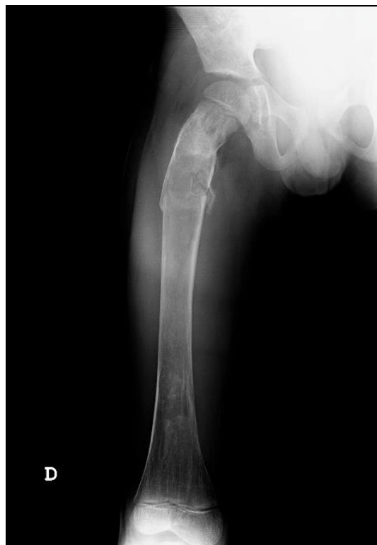
Figure 2A: Anteroposterior and lateral xrays of femur, showing the fibrous dysplasia and an undisplaced fracture through the cist.

After informed consent signed by the parents responsible for the patient, the orthopedic team performed on the proximal femur fracture a surgery with bone grafting (combining morsalized and structural bone) and plating (Figure 2A and