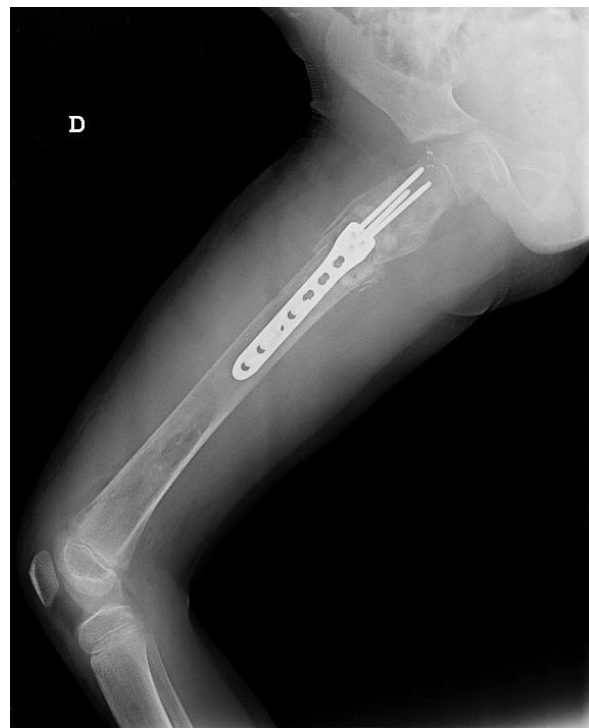
Figure 3B: Anteroposterior and lateral x-rays of femur, showing the surgery result of curettage, bone grafting and plating on the fracture 3B.

We decided to use allograft based on the availability of bone bank, the extension of the lesion, demanding a huge