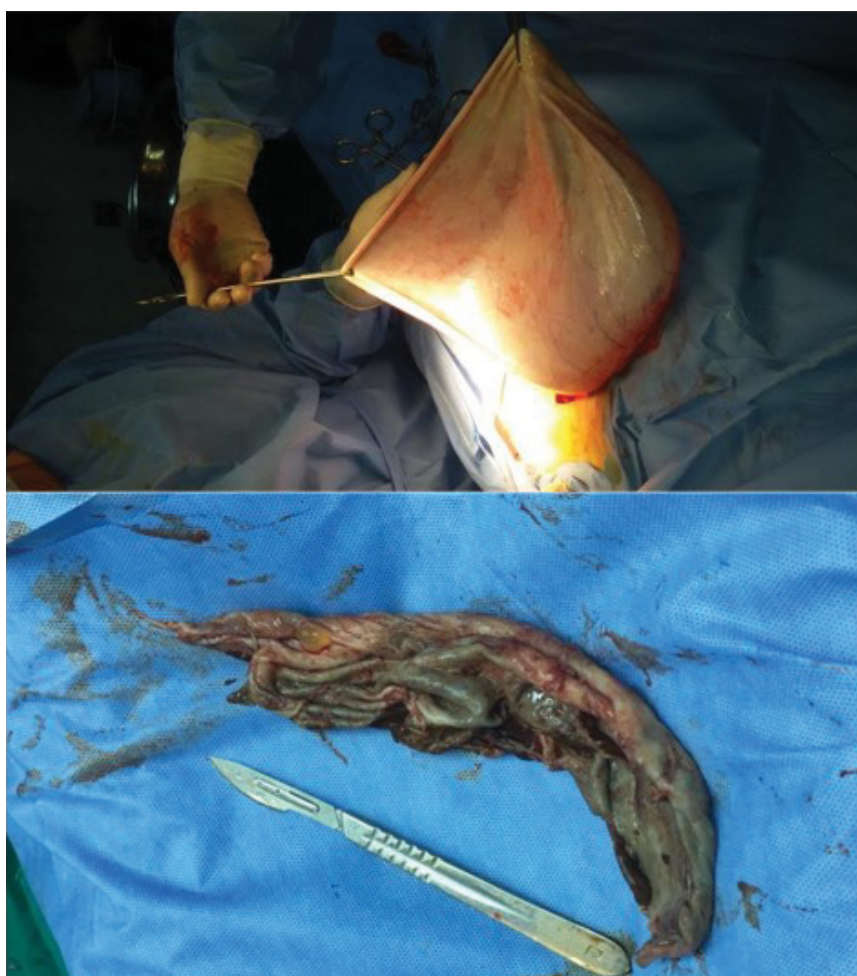
Figure 2: Huge cyst extracted via a 4 cm minilaparotomy incision.