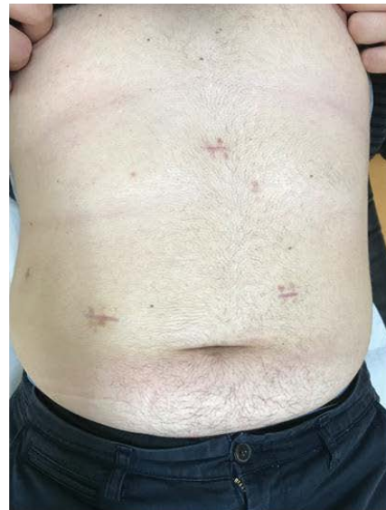
Figure 1: Abdominal incision scars six months after operation. Six months after the operation the cosmetic effect is superior to open surgery, the patient has no functional disabilities.