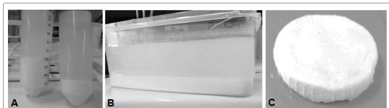
Figure 2: A) Clotting assay using cyprosin (left) and microbial rennet (right) and donkey milk; B) Assay carried out with optimized experimental conditions using 4 liters of donkey's milk, cyprosin, 0.1% (w/v) \text{CaCl}_2 at 32 °C; C) Cheese produced after coagulation using cyprosin and whey removing.