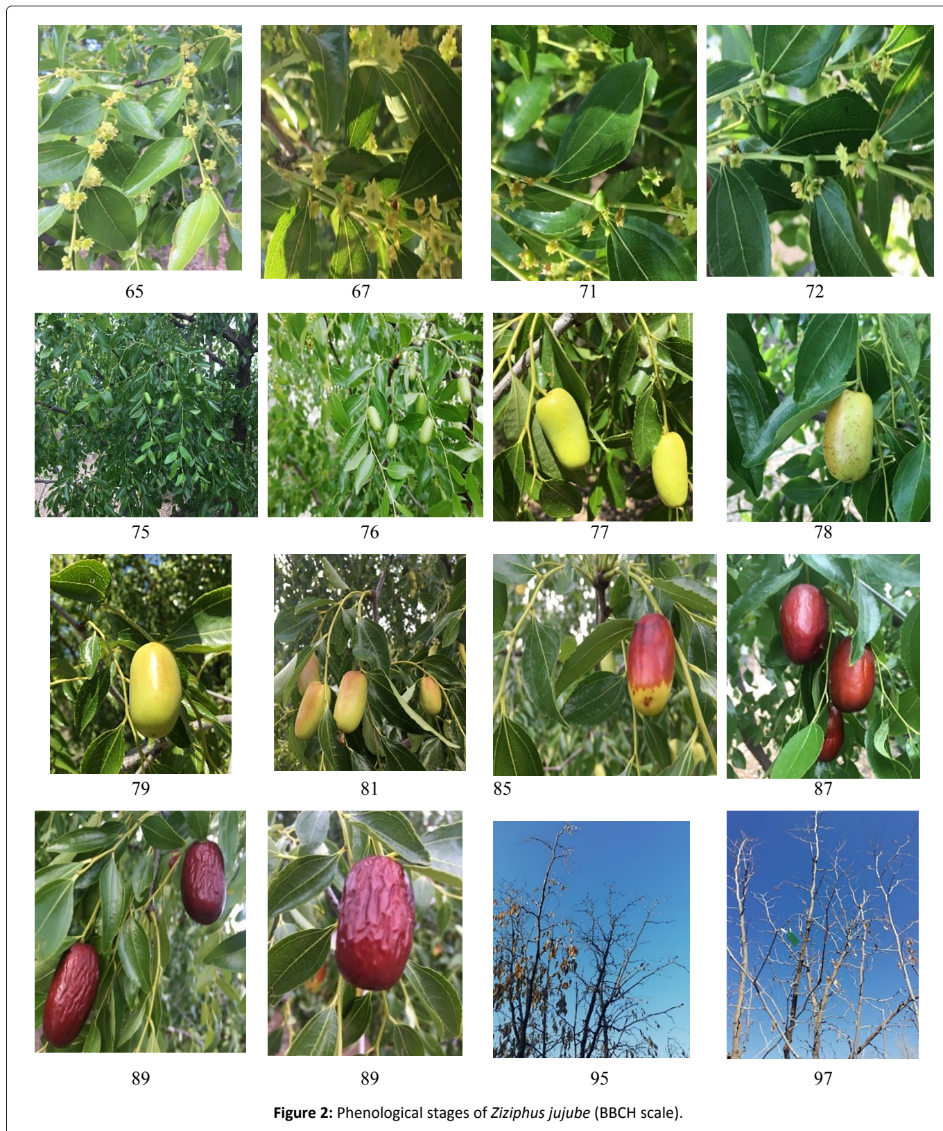
Figure 2: Phenological stages of Ziziphus jujube (BBCH scale).

Notably, eight major phenological stages were observed for Chinese jujube; three for vegetative stage, four for the reproductive phase and one for winter dormancy. The major growth stages were bud growth, leaf formation and growth, shoot growth, formation of inflorescence, flowering, fruit formation, growth and development, fruit maturation, and winter dormancy. Each major stage consisted several secondary