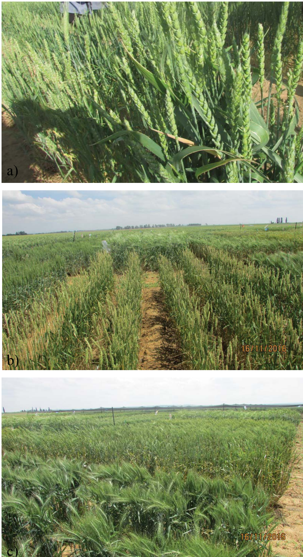
Figure 1: Wheat trial at ARC-small grains (S28,15670°E28,29525°) during 2016: a) Bolane; b) Witwol; c) Makaloate.