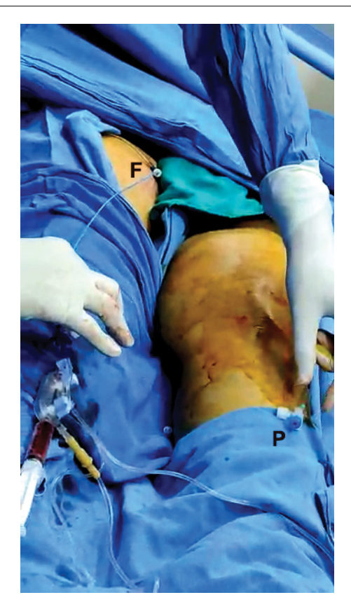
Figure 3: Separate sheaths in the left femoral vein (F) and right popliteal vein (P).

The clinical condition of the patient improved rapidly, and the PA pressure fell initially to \frac{1}{2} and by next day to \frac{1}{3} systemic. A check venogram revealed a complete resolution