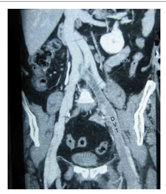
Figure 1: A CT venogram showing the deep venous thrombosis (DVT) in the femoral and iliac veins. The IVC is free of clots.

Citation: Bedi HS, Singh JD, Arora V, et al. (2023) First Documented Case of Massive Pulmonary Embolism and Massive Ilio-Femoral Deep Venous Thrombosis Treated Simultaneously. Clin Hematol Res 6(1):78-81