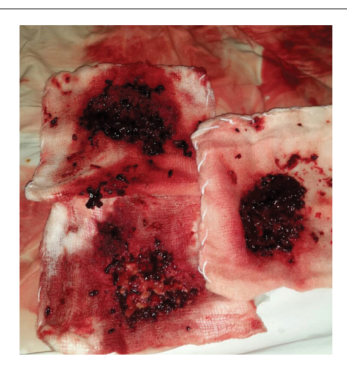
Figure 5: Multiple blood clots removed by suction after fragmentation.

Citation: Bedi HS, Singh JD, Arora V, et al. (2023) First Documented Case of Massive Pulmonary Embolism and Massive Ilio-Femoral Deep Venous Thrombosis Treated Simultaneously. Clin Hematol Res 6(1):78-81