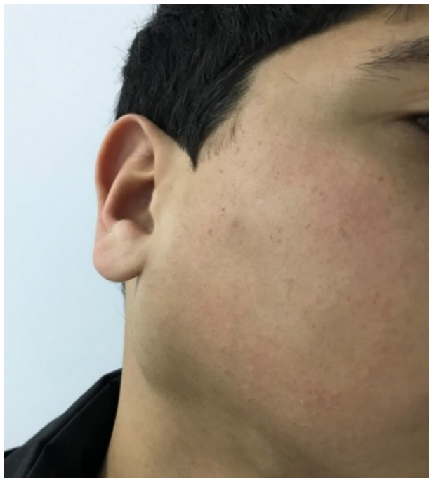
Figure 1: No problems with the face symptoms of the facial nerve, internal organs - the opening of the mouth.

Tumors of the salivary glands of glandular origin are rare in the pediatric age group, and only about 1.7% of all