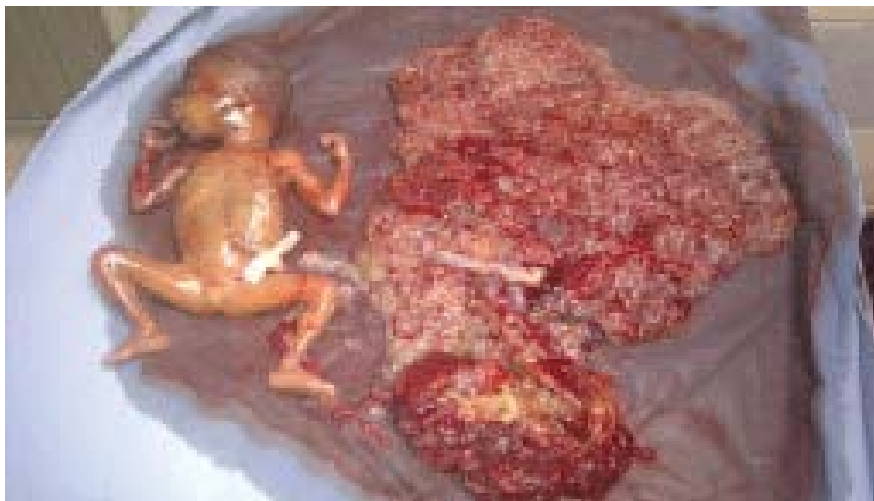
Figure 2a: Morphologically normal fetus (A) and a normal placenta (P) next to a placenta with a molar appearance (M).