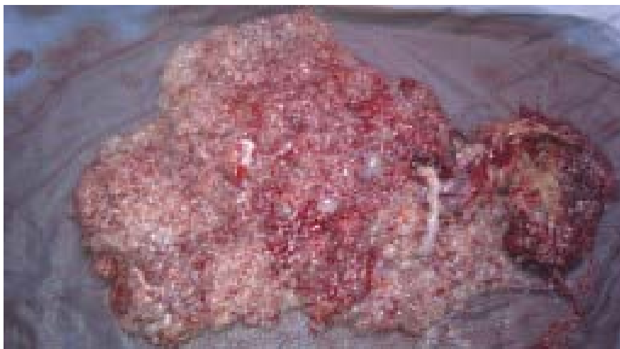
Figure 2b: Delivery product: Coexistence of a normal placenta (P) with a large vesicular placenta in molar transformation (M).