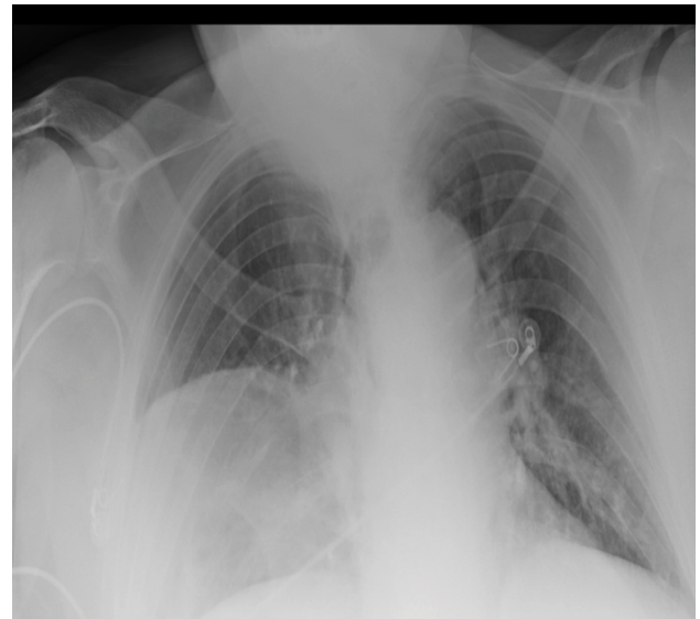
Figure 1: Emergency room chest X-ray; showed elevation of the right hemidiaphragm.

Due to the findings, urgent surgical management was decided.