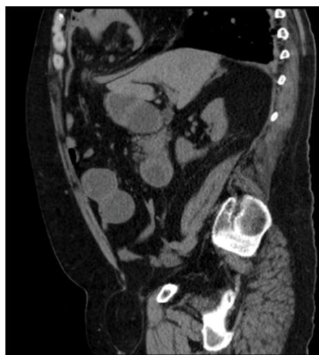
Figure 3: Sagittal CT.