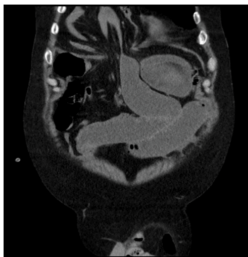
Figure 2: Coronal CT.