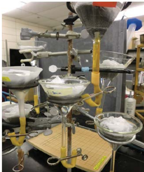
Figure 1: a) Ozone generator, reactor, and sample ozonation; b) Soaking of samples after ozonation in Baermann funnels for 24 h and 48 h and draw-off of the filtrate to collect viable nematodes for counting and assessment of treatment.

°C, soil was kept in a refrigerator at 5 °C until the ozonation experiments. Increasing the level of ozonation was obtained by ozone from oxygen, while lower levels were generating ozone from air. After ozonation, the five samples were soaked in Baermann funnels (Figure 1b) [42] at room temperature. Since only viable nematodes migrate down through the soil sample, penetrate the filter and fall down into the distillate, nematode viability was easily determined by comparing nematode counts in the treated and untreated samples in the distillate after 24 h and 48 h. Nematodes were counted with the aid of an inverted compound microscope at x40 magnification. Viability was determined as the total number of nematodes