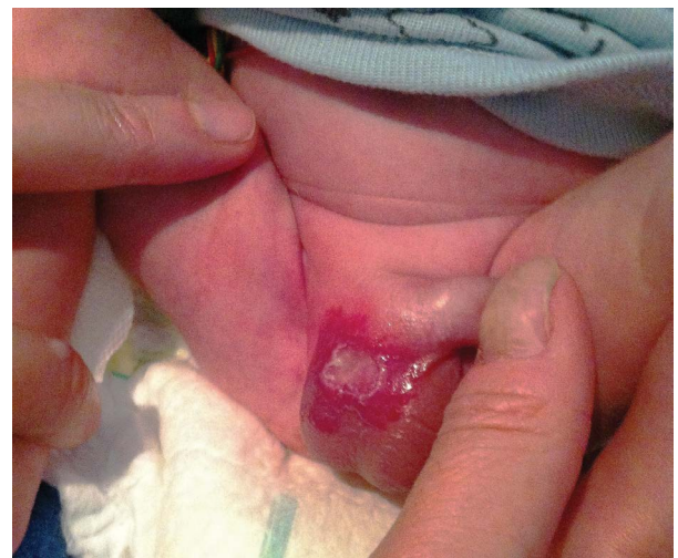
Figure 1: A red plaque of 3 cm of diameter on the right part of the scrotum with a central exudative erosion of 1.5 cm.

At 37-weeks of post menstrual age (58 days of chronological age) and 1895 g of weight, it was decided