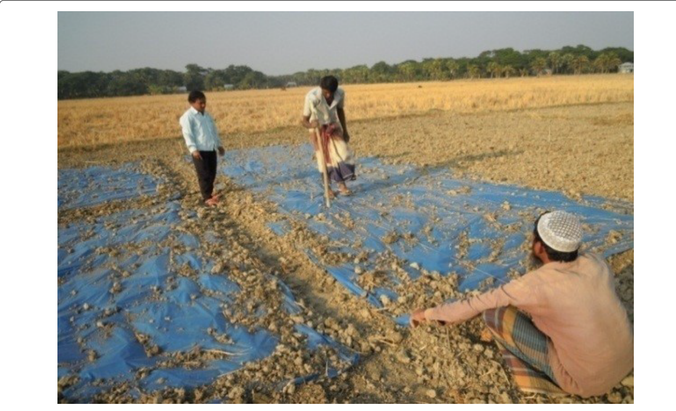
Figure 2: Preparation for hole on polythene sheet of the present study.

h [27]. Fresh seeds were oven-dried at 50 °C for 2 d and weighted to determine the average seed yield and 200-seed weights [28].