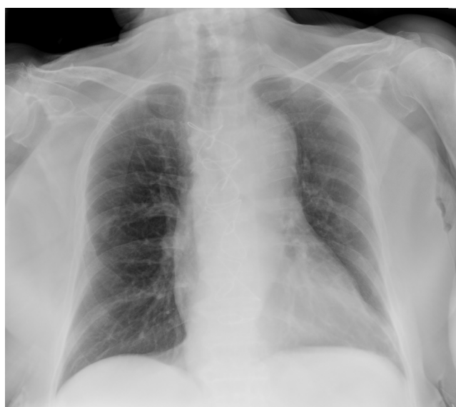
Figure 4: Chest X-ray at hospital discharge (6 th August).