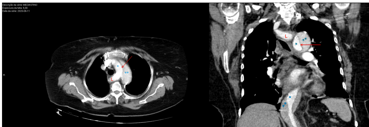
Figure 1: Preoperative thoracic computed tomographic angiography: Acute Stanford type A aortic dissection with intimal flap (arrow) and lusory artery (L).

In the first 24 hours following admission to the ICU, the patient showed electrical and hemodynamic instability with