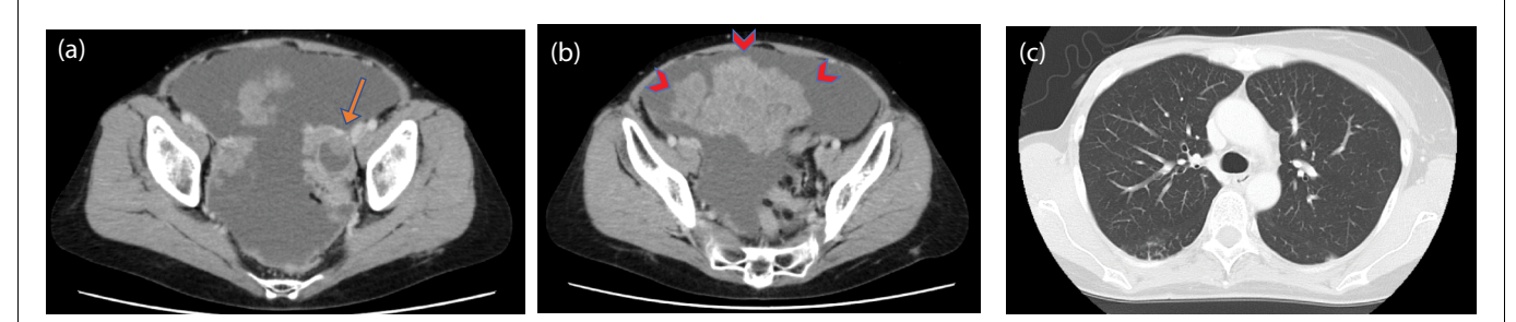
Figure 2: (a,b) Abdominal CT revealed ovarian cancer (long arrow) and peritoneal dissemination (arrowhead); (c) No lung metastases were identified in chest CT.

Figure 1: (a,b,c) Chest computed tomography (CT) scans showed multiple lung metastases from breast cancer recurrence (long arrow).